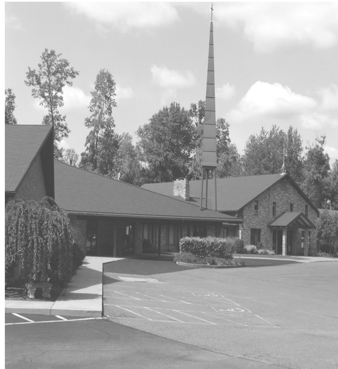
HONORING THE PAST...EMBRACING THE FUTURE HARTVILLE CHURCH OF THE BRETHREN