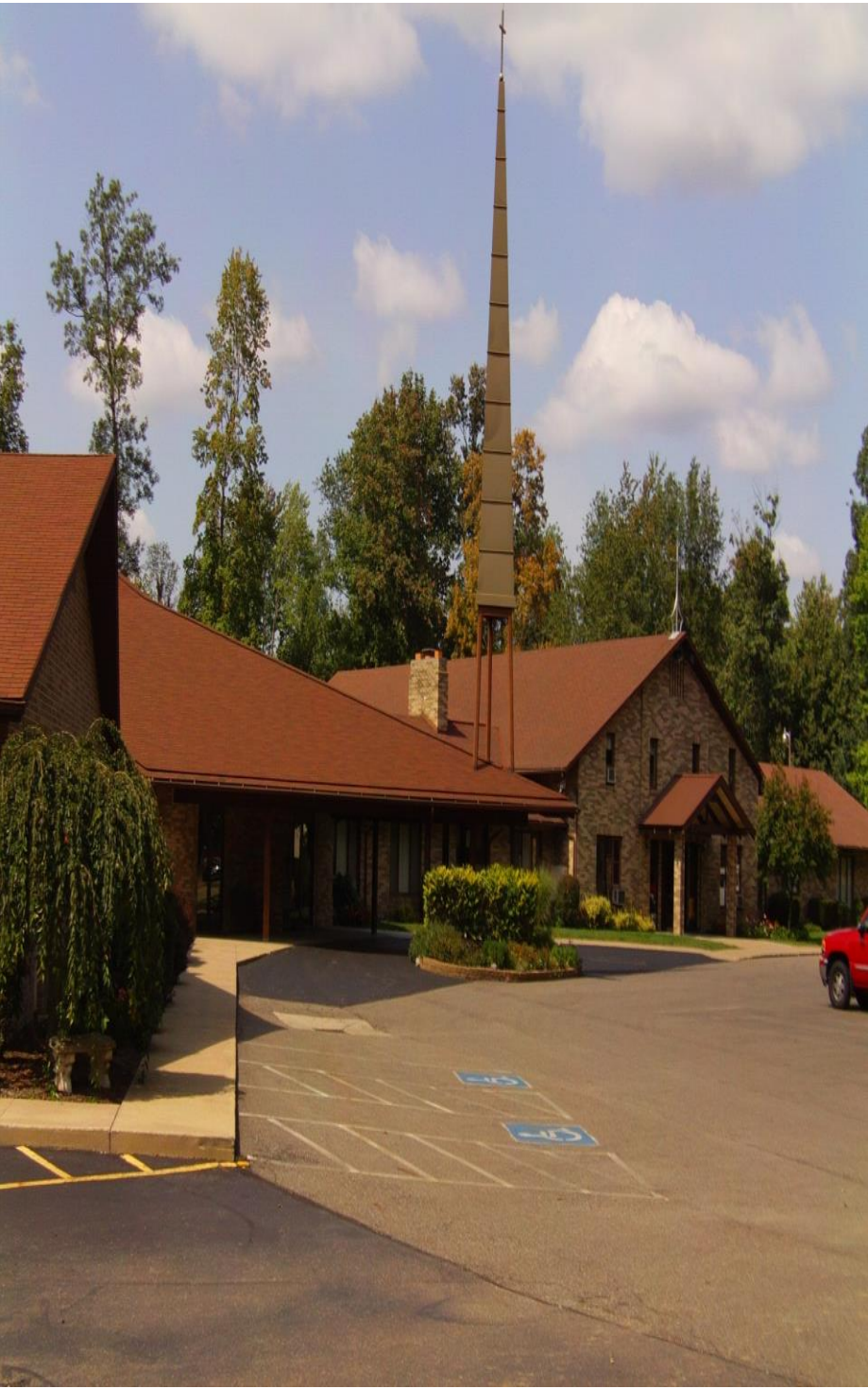
HARTVILLE CHURCH OF THE BRETHREN HONORING THE PAST EMBRACING THE FUTURE