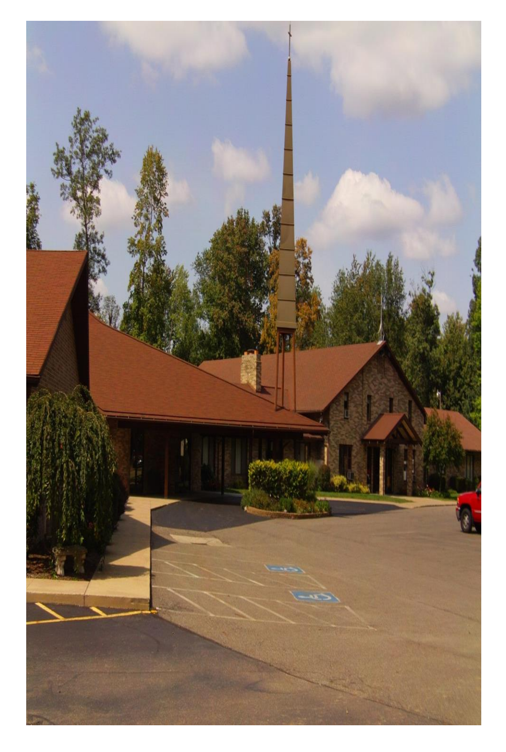
HARTVILLE CHURCH OF THE BRETHREN HONORING THE PAST EMBRACING THE FUTURE