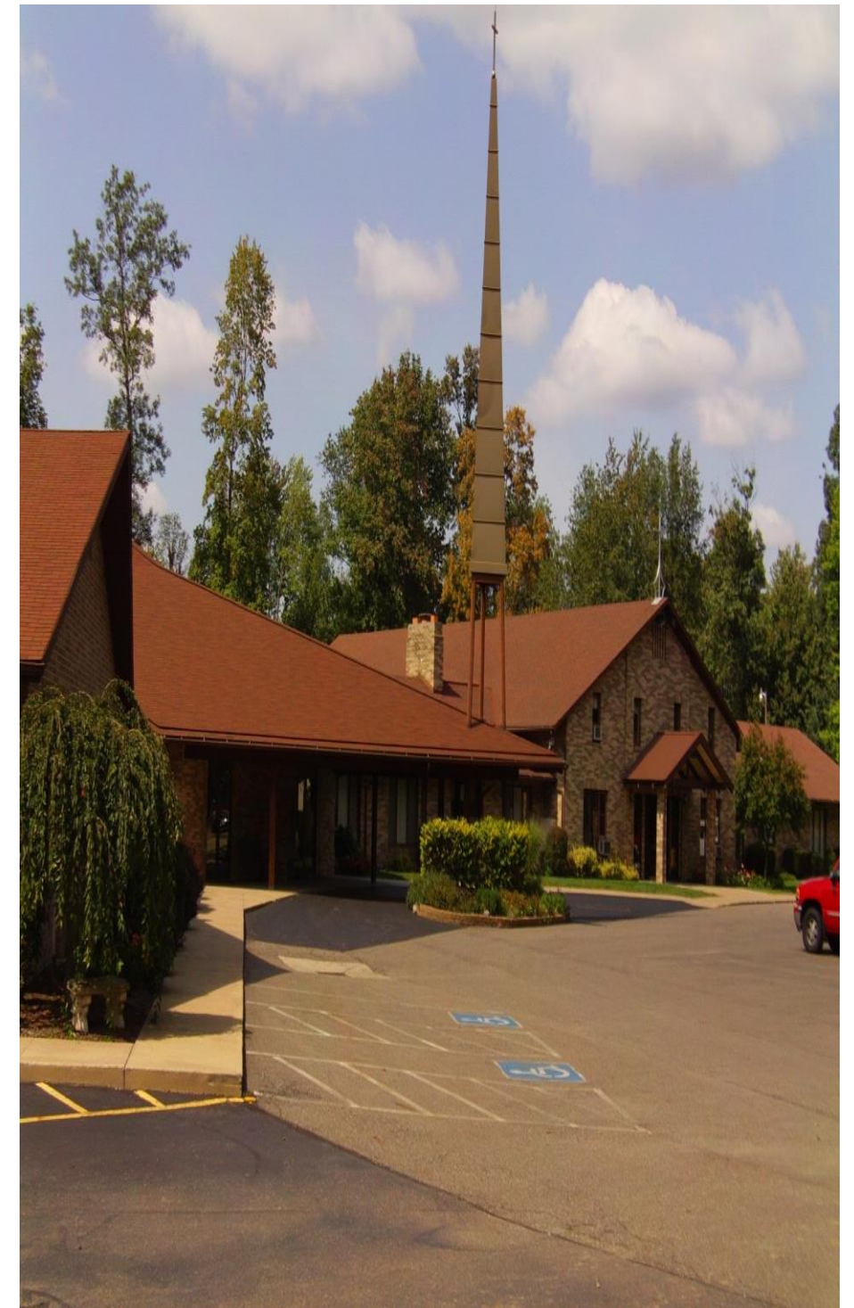
HARTVILLE CHURCH OF THE BRETHREN HONORING THE PAST EMBRACING THE FUTURE