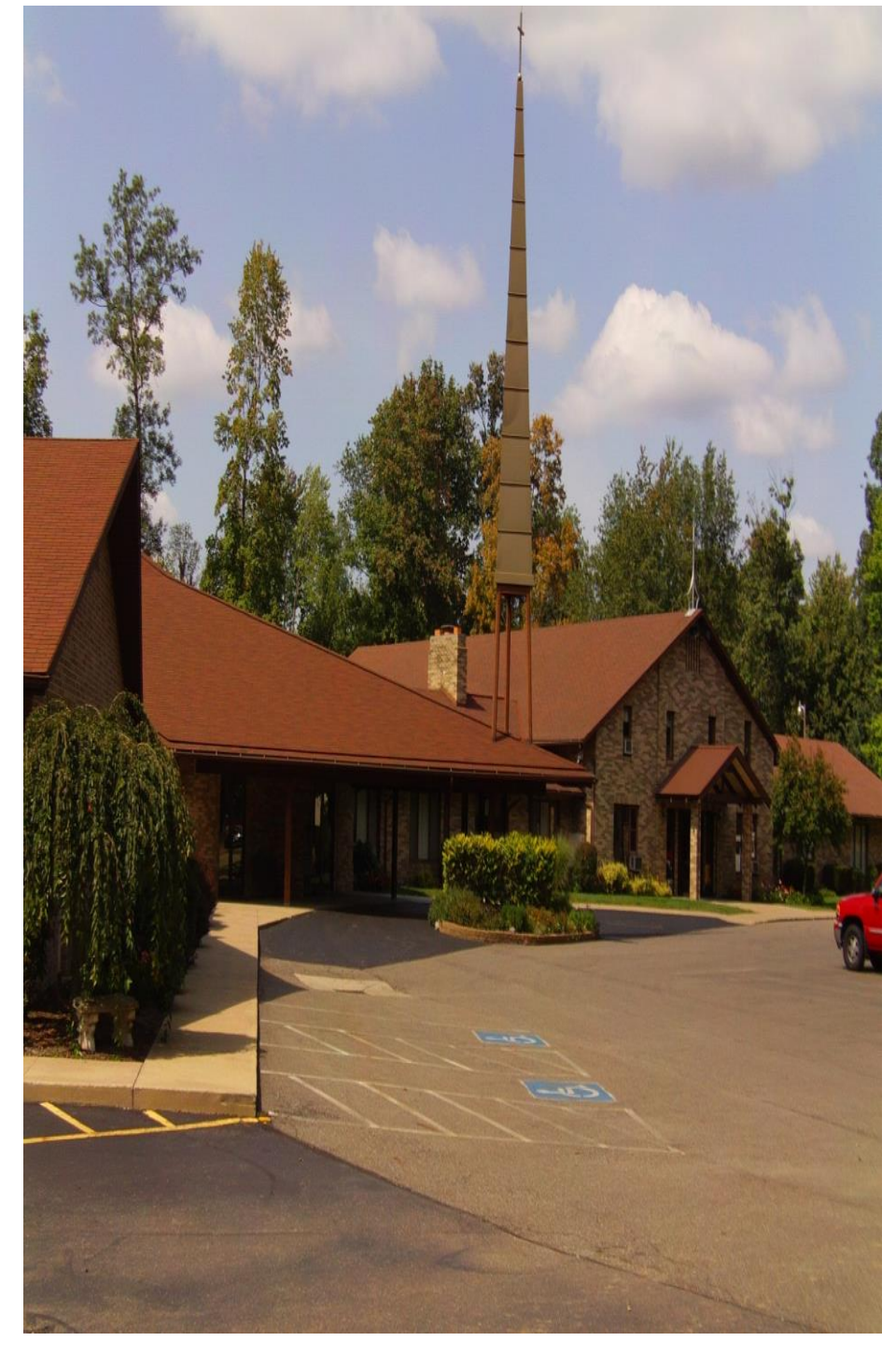
HARTVILLE CHURCH OF THE BRETHREN HONORING THE PAST EMBRACING THE FUTURE