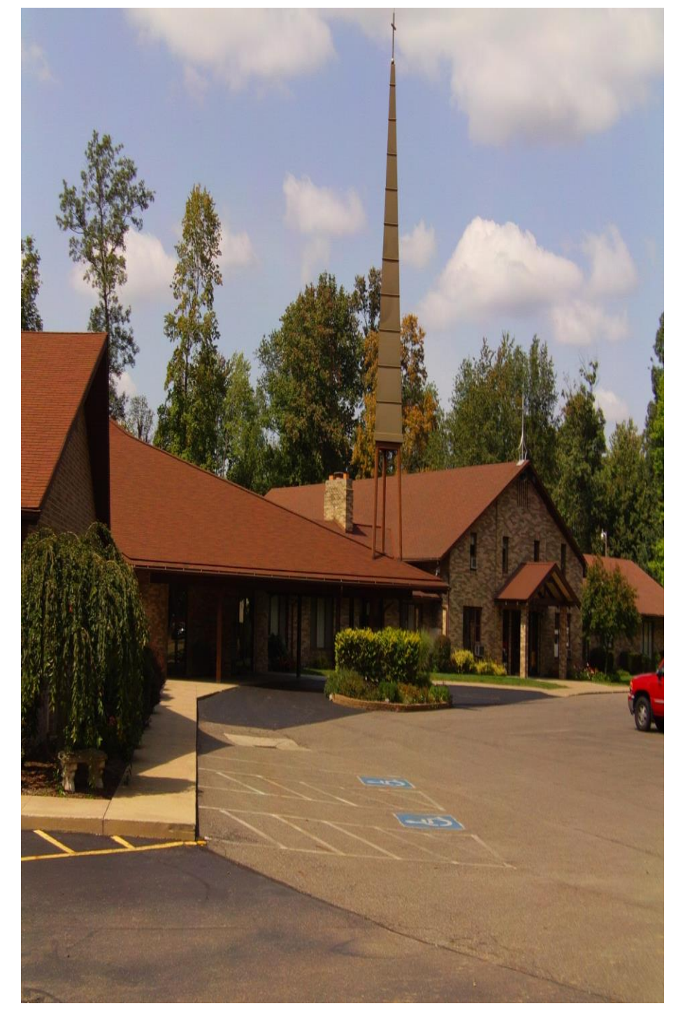
HARTVILLE CHURCH OF THE BRETHREN HONORING THE PAST EMBRACING THE FUTURE