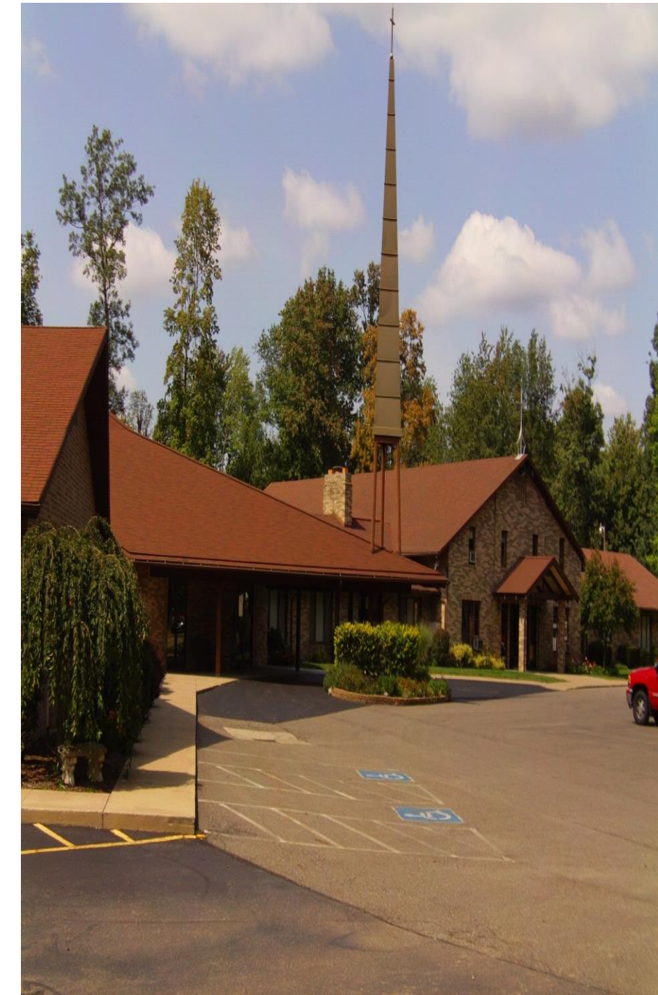
HARTVILLE CHURCH OF THE BRETHREN