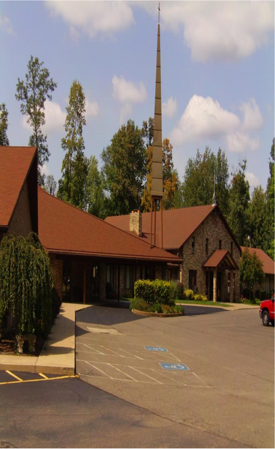
HARTVILLE CHURCH OF THE BRETHREN

There are six things the Lord hates — no, seven things he detests: haughty eyes, a lying tongue, hands that kill the innocent, a heart that plots evil, feet that race to do wrong, a false witness who pours out lies, a person who sows discord in a family. Proverbs 6:16-19